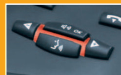
▲ Audio control keys

Audio control functions (loudspeaker volume control, hands-free audio control, mute, etc) are separated from the system's function keys to facilitate easy and clear audio control for the user.